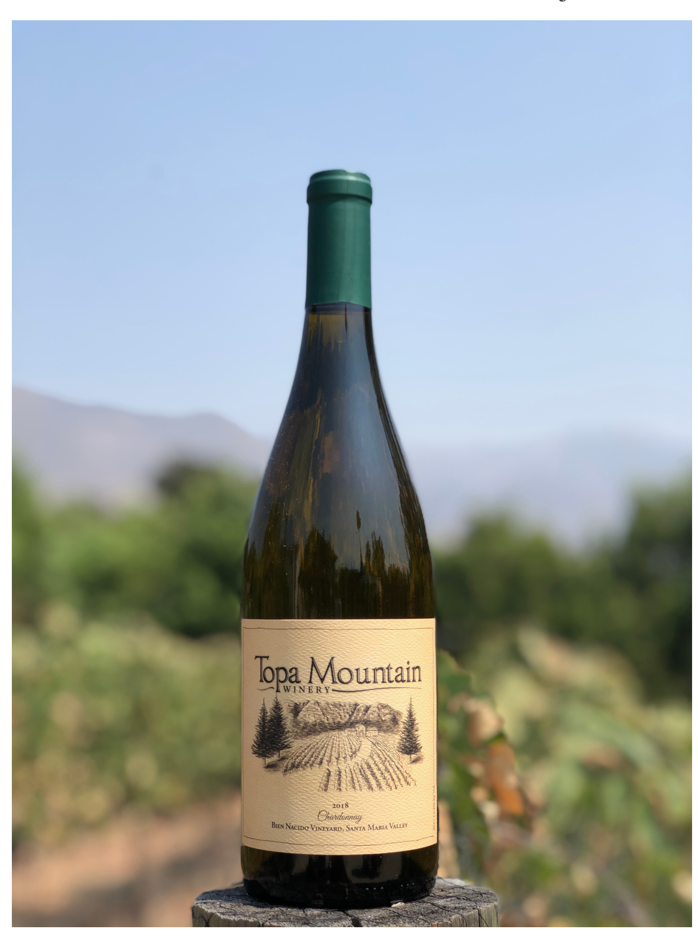
204 CASES PRODUCED